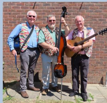
Tideway Folk Group