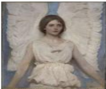
'Angel' by Abbott Handerson Thayer 1887