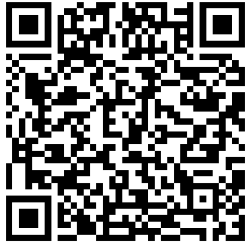
ASH CHURCH PCC