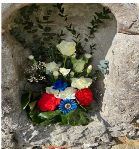
Coronation Flower Display - Arranged by Lucy Mcnaughton (see page 10)