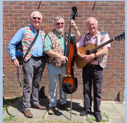
Tideway Folk Group